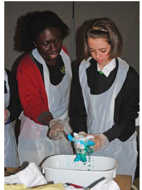
Tie-dying in the "Fashion" sector