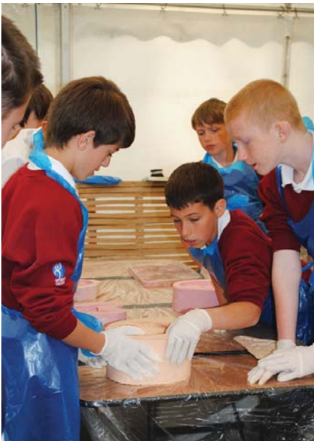
Students from North School in the "Construction" sector