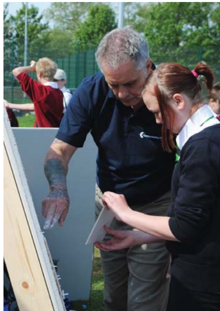
Having a go at tiling in the "Construction" area